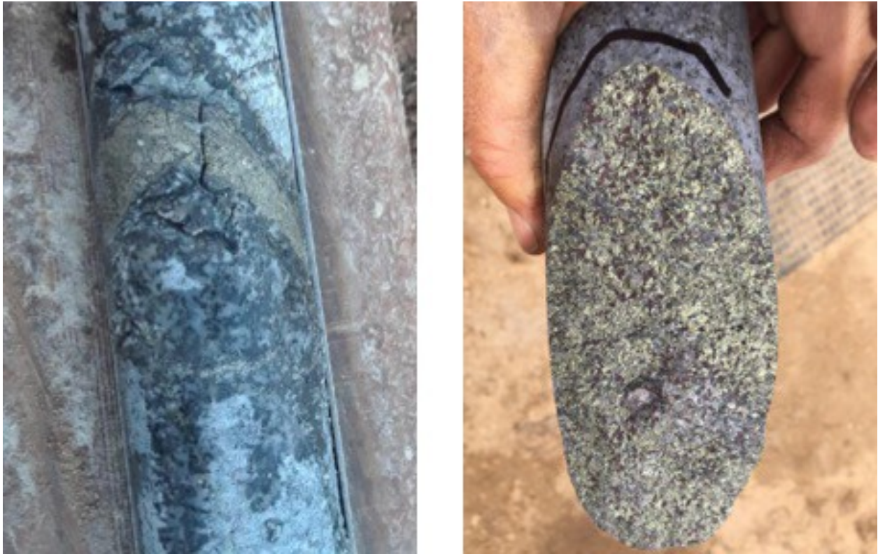
Figure 1*: Significant chalcopyrite veins encountered at approximately 814 metres (left) and 822 metres (right).

K-20 is believed to be located at the edge of the porphyry copper system, as indicated by a deep resistivity low located by a Magneto-Telluric (“MT”) survey completed by a previous joint venture partner with Bell Copper in 2017. Deepening the hole may be able to explain the source of the low resistivity anomaly that appears to lie below and to the SE of the current bottom of K-20.