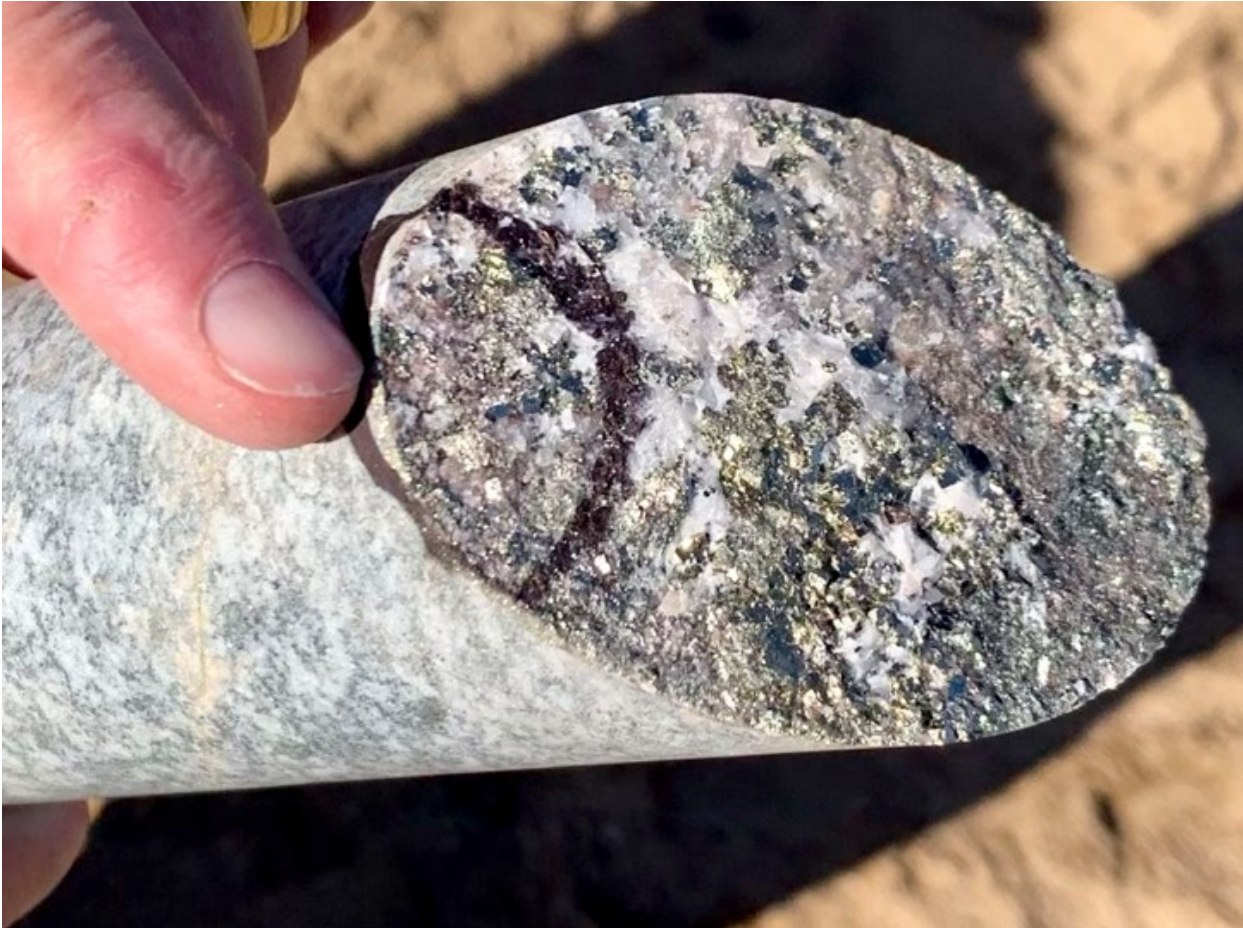
Figure 3*: Bornite and chalcopyrite mineralization along fracture plane at approximately 1,020 metres.