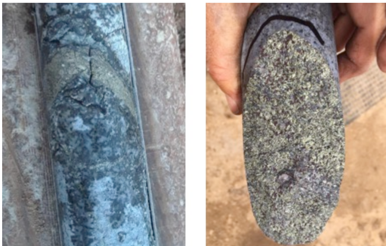
Figure 1*: Significant chalcopyrite veins encountered at approximately 814 metres (left) and 822 metres (right).

hydrothermal magnetite filling fractures and veins and secondary biotite alteration. The appearance of potassic alteration with more frequent veins and quartz stringers suggests that K-20 has approached the higher temperature region of the porphyry system, suggesting proximity to the porphyry copper target. K-20 is currently at a depth of approximately 1,045 metres, and drilling has been paused for further geophysical studies and a review of the geological model. Full assay results are pending.