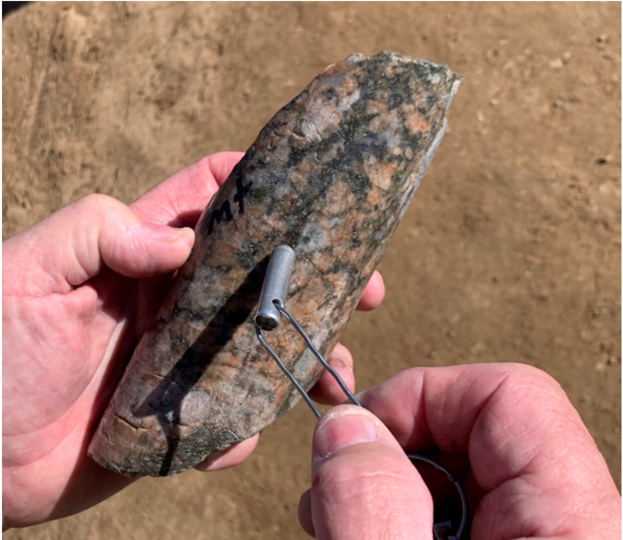
Figure 2: Hydrothermal magnetite with chalcopyrite-pyrite and pervasive potassic alteration at approximately 1,032 metres.